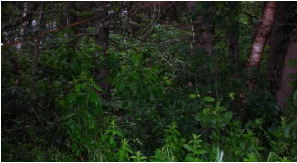
Bedeque woods. Photo by Caroline Jones, 2012.