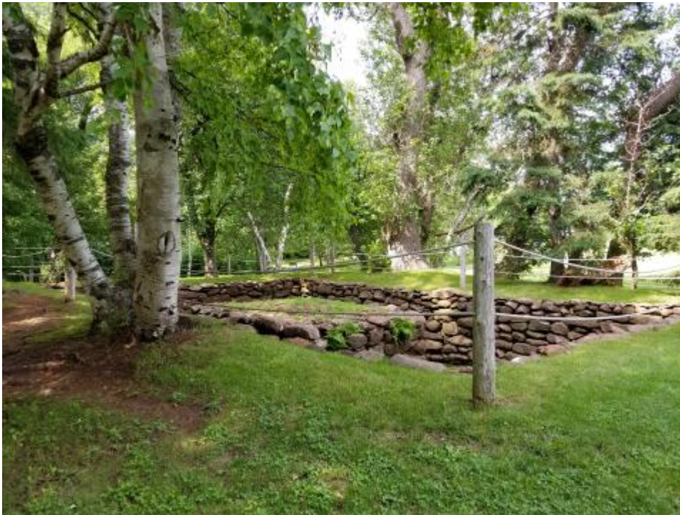
The cellar and foundation of L.M. Montgomery's childhood home in Cavendish, Prince Edward Island. The original kitchen, which had been elsewhere, was returned to the site in late 2018.