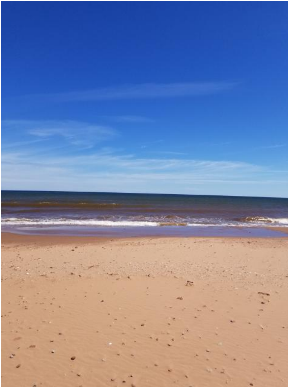
North Shore beach.