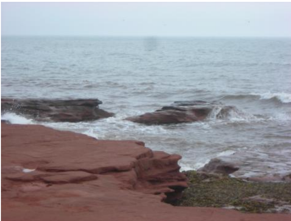
Gulf of Saint Lawrence.

And now, after the ravages of hurricanes Dorian in 2019 and Fiona in 2022, this wildness is intensified. Dorian uprooted thousands of trees across the Island, including many at the Montgomery homesite. Fiona downed countless trees and devastated the sand dunes along the North Shore, meaning that beach access and roads across PEI National Park remained closed for several months after Fiona made landfall. 17 Dorian and Fiona—and even less powerful storms—remind us that nature can be not only soothing, healing, peaceful, and pastoral but also powerful, ruthless, and indiscriminately destructive. The Island is not an idyllic, pastoral landscape. It is,