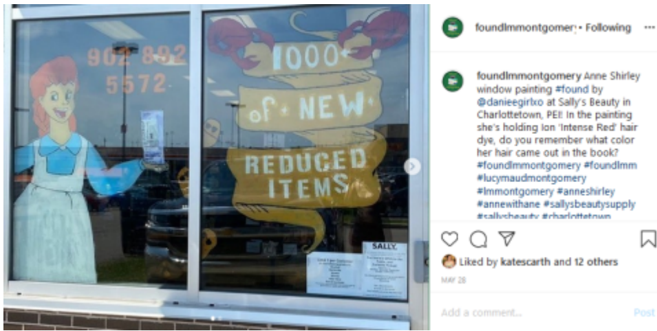
Anne Shirley on the window of Sally's Beauty Salon in Charlottetown. 2020.

For the 2020 L.M. Montgomery and Vision Forum, we are challenging all of you to join the @foundlmmontgomery community and share your findings of Montgomery with us either by tagging us, DMing us (@foundlmmontgomery), or using our hashtag (#foundlmmontgomery). To kickstart this community engagement, which we hope will continue long after the Forum, we are establishing a mini challenge for five days (June 24–28) with a goal of receiving ten submissions a day (for an overall goal of fifty) and to reach a hundred followers. So, start searching and stay tuned to see what we are sharing!