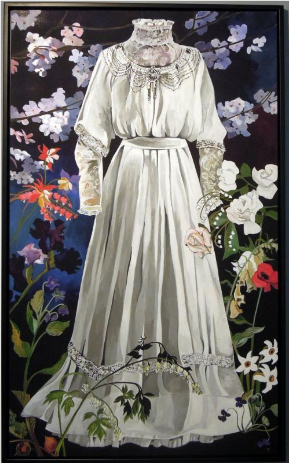
Lucy Maud's Wedding Dress, 2019, acrylic on canvas, 36" x 60".