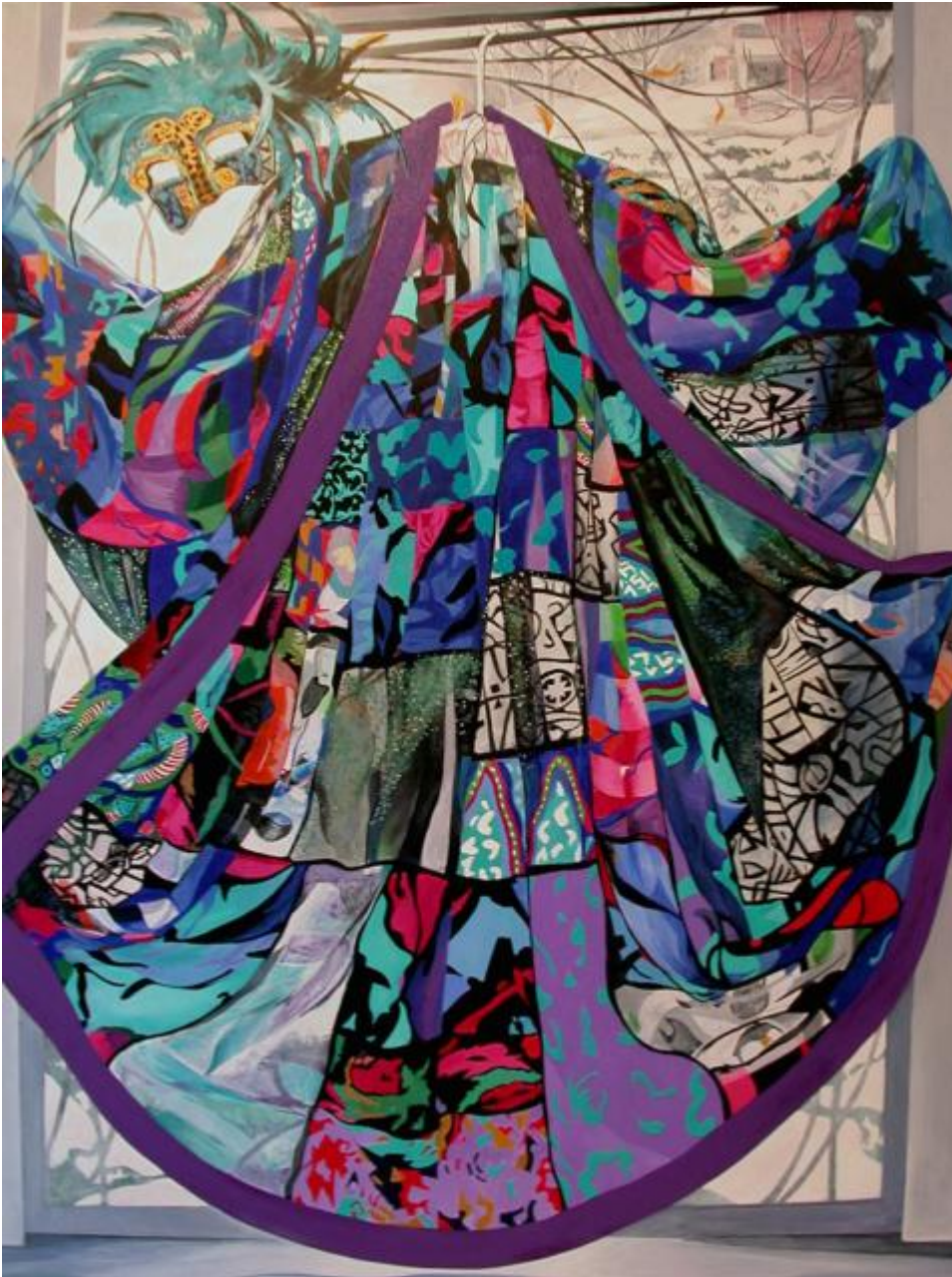
Margaret's Dress , acrylic on canvas, 36" x 48". I approached Margaret Atwood after reading Cat's Eye . She chose the dress coat that she bought in Australia while writing that book.