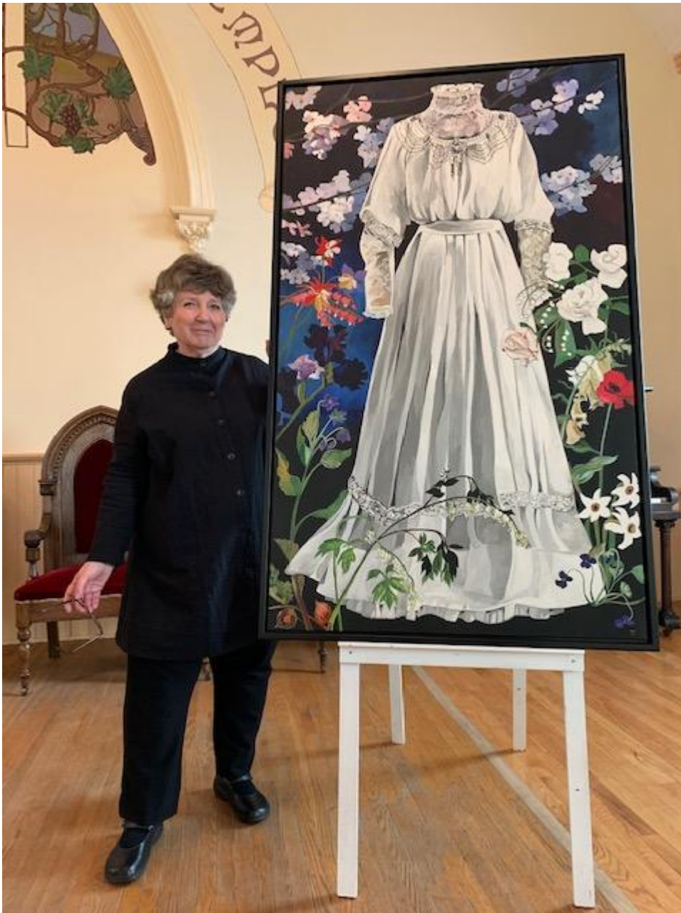
Unveiling of the work at Leaskdale, Ontario, 2019. The work was donated to the L.M. Montgomery Society of Ontario in Leaskdale, Ontario, in 2023.

Here are some other paintings with an emphasis on writers from the dress project: