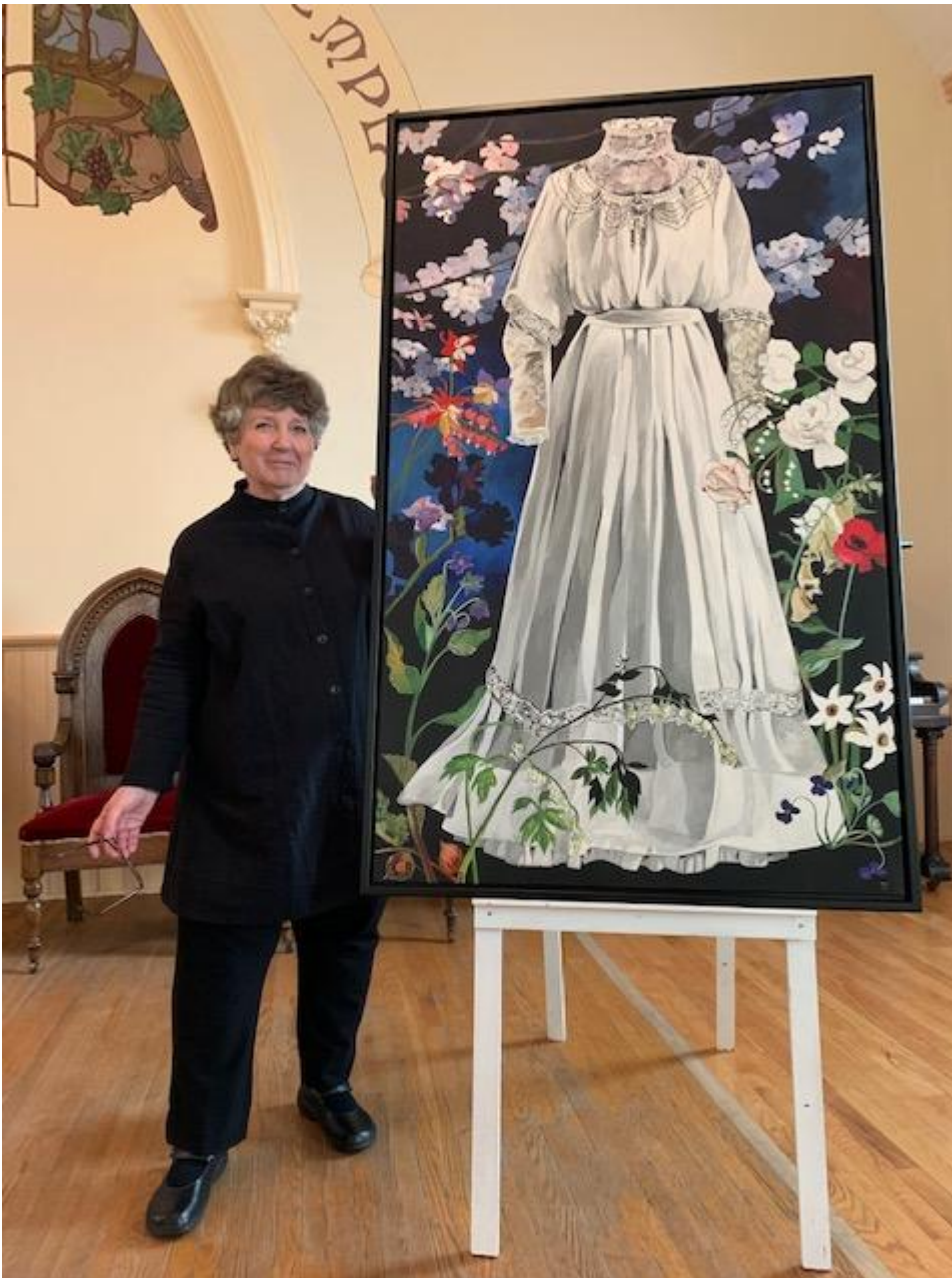
Unveiling of the work at Leaskdale, Ontario, 2019. The work was donated to the L.M. Montgomery Society of Ontario in Leaskdale, Ontario, in 2023.

Here are some other paintings with an emphasis on writers from the dress project: