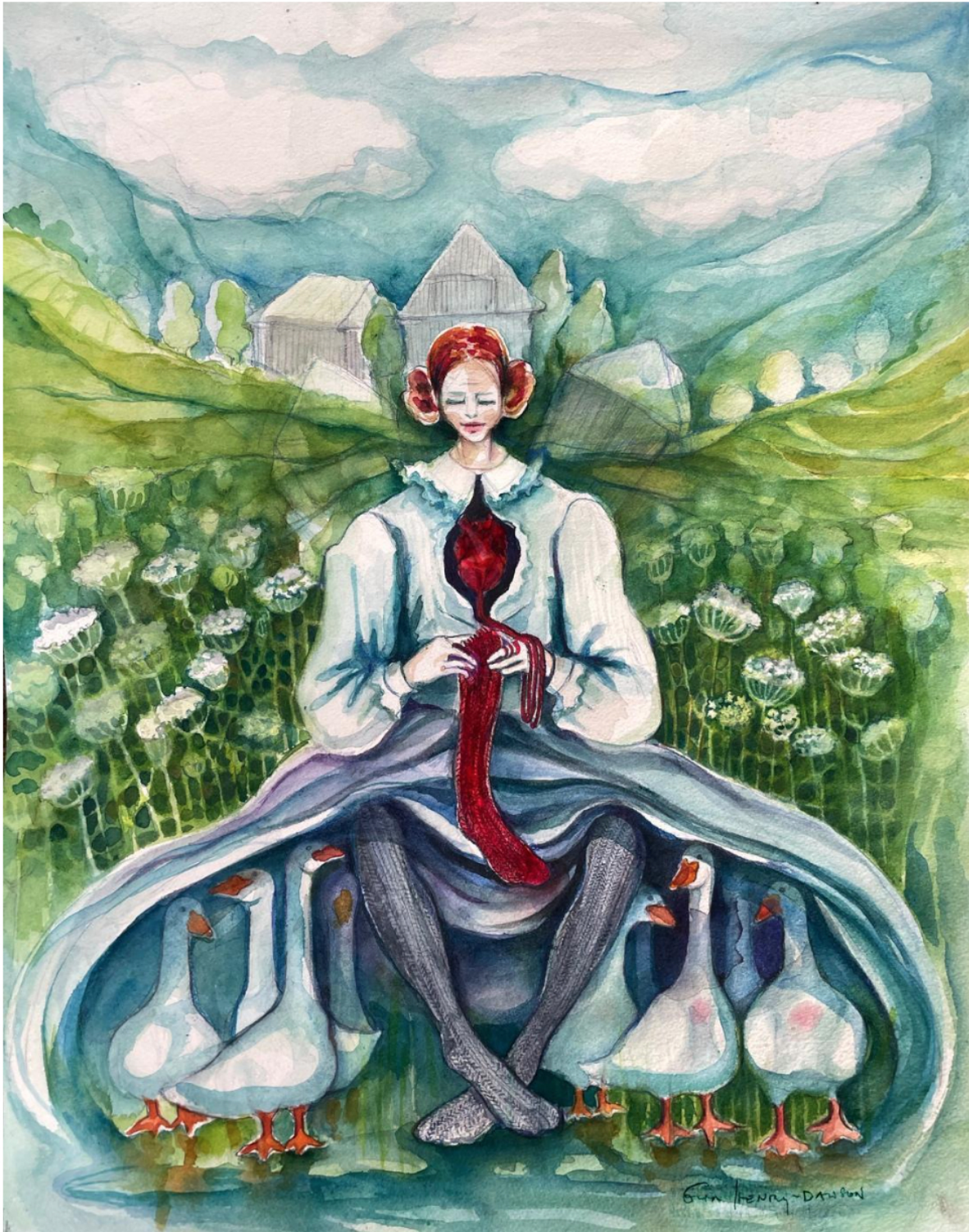
Leslie , Watercolour

“Abner Moore held the mortgage on the West farm, and the interest was overdue some years, and Dick just went and told Mrs. West that if Leslie wouldn’t marry him he’d get his father to foreclose the mortgage ... And Leslie gave in—she loved her